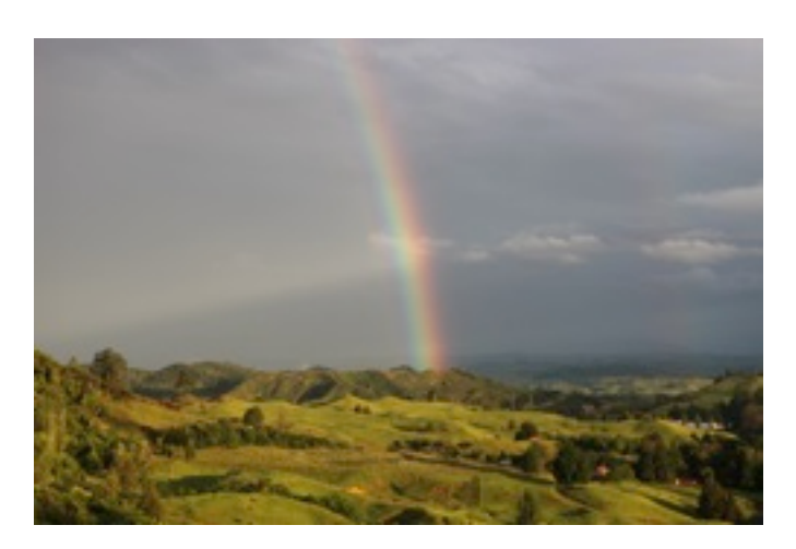
The evening view across the Waitomo Caves

There has been some excellent content in recent journals, thanks to those contributors, and we look forward meeting many of you at Wee Jasper soon.